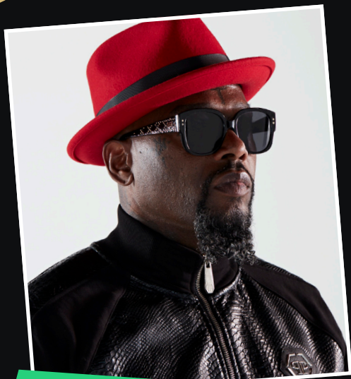
Treach of Naughty by Nature

“Feel Me Flow” “O.P.P. ” “Hip Hop Hooray”